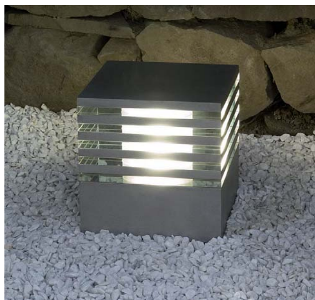
Type plain aluminium